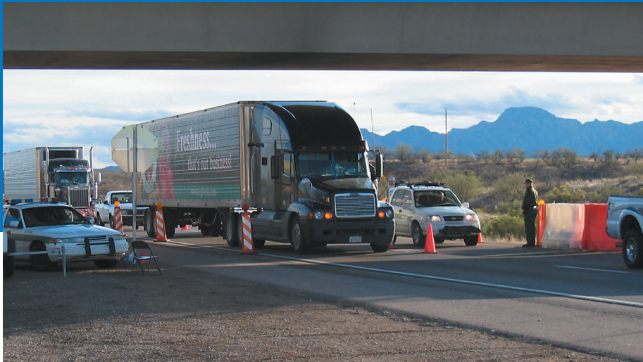
MicroSearch® detects unauthorized individuals hiding in vehicles and containers.