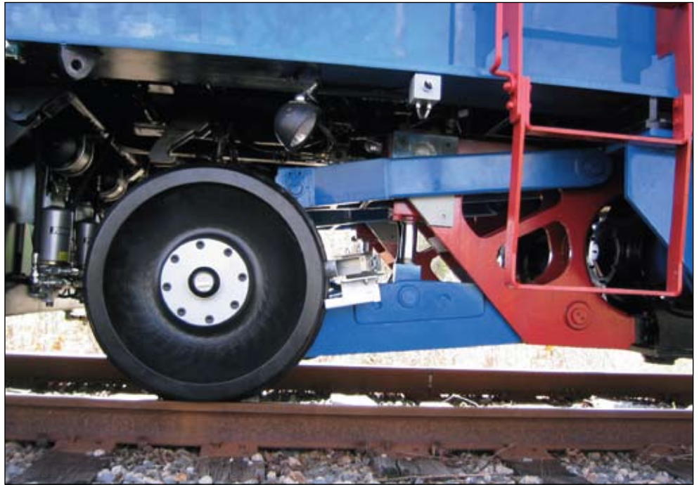
Deployable GRMS Measurement Axle this technology plays an important role in ensuring the safety of many U.S. railroad tracks.