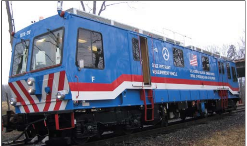
Deployable GRMS onboard FRA's DOTX-18 test vehicle is a result of ENSCO's close partnership with the FRA and industry to quickly bring new technology to bear on safety and performance.

The DGRMS measurement axle is designed as a fifth axle that is deployed from the frame of a track geometry vehicle instead of using one of the vehicle's running axles. The axle is attached to a custom suspension that can vertically load, raise and lower, and properly align it with the track. This suspension allows the axle to be suspended from the underside of a railroad car and operate separately from the four running axles. The measurement axle is suspended such that regardless of the roll, pitch or vertical movement of the rail car body on its suspension, or the curvature, profile, alignment and crosslevel of the track, both wheels of the measurement axle are always kept on their respective rails in proper alignment. The system also loads the measurement axle against the upper surface of the rails with a constant load that is always perpendicular to the plane formed by the upper surfaces of the rails. In addition, the suspension lifts and lowers the measurement axle assembly to allow it to be used or stowed at will, and orients the measurement axle so that the