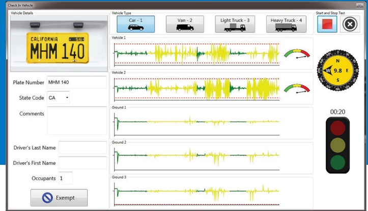
MicroSearch detects unauthorized individuals hiding in vehicles and containers.